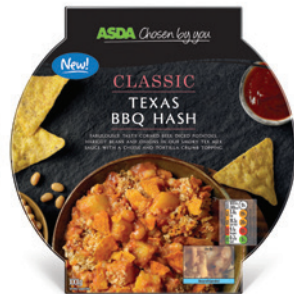
Packaging artwork (cutouts, retouching & artwork to guidelines)