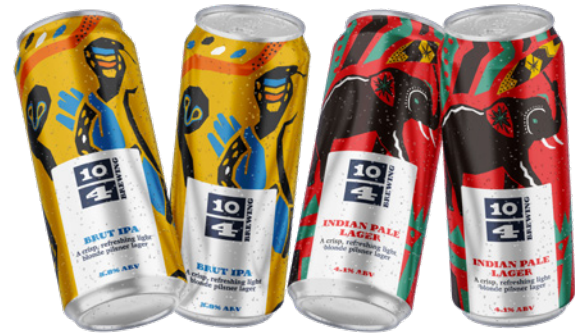
Retouch product onto pack visual.