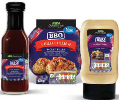
Packaging artwork (cutouts, retouching & artwork to guidelines)