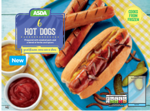
Packaging artwork (cutouts, retouching & artwork to guidelines)