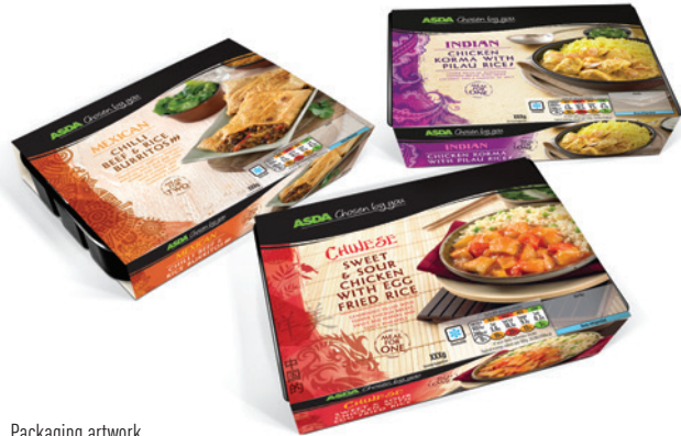
Packaging artwork (cutouts, retouching & artwork to guidelines)